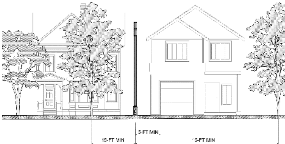
Figure 1 – Example of Acceptable Location Between Residential Homes: