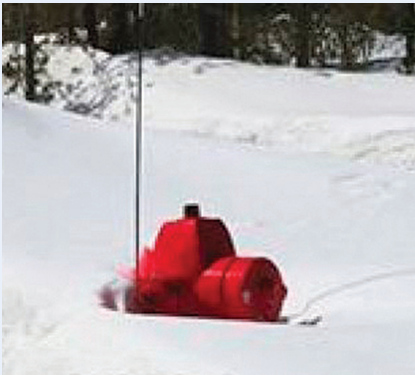
Buried fire hydrants can cause serious delays for firefighters responding to a fire.