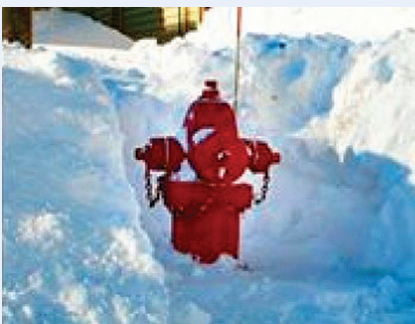
Your effort to clear hydrants of snow may help save your, or your neighbor's, home.

hours. Although primary responsibility lies with the resident, the City will assist as time and equipment allows. Priority walks, such as those leading to schools, will be cleared first.