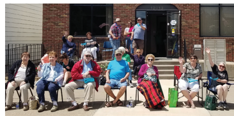
Rogers Seniors enjoy a variety of outings and activities throughout the year.

more. More than 60 trips have been provided since 2013 and there is always something new for us to explore.